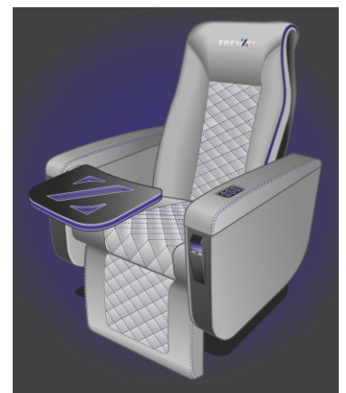
Illustration: Jan Seidl